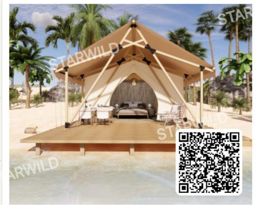
Starwild Glamping Hexagram