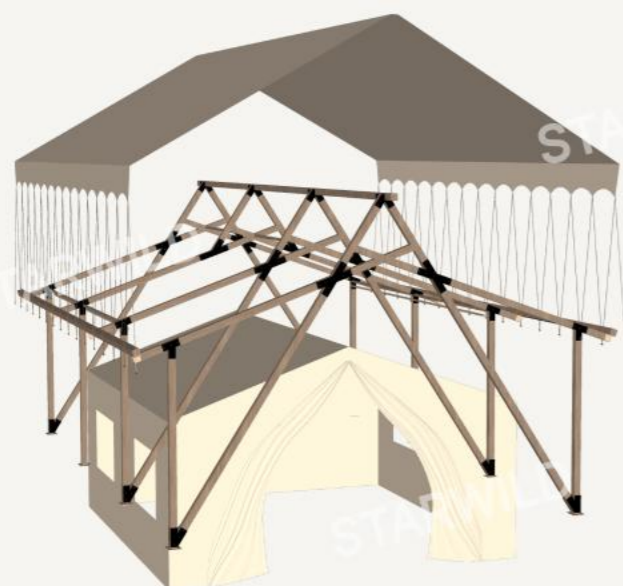
(3D Render-Exploded View)

Main Pipe: 80x80 Galvanized Square Tube, 2.0mm Thickness TIG Welding (Tungsten Inert Gas Welding) Outdoor Specialized Baking Paint Treatment (Resistant To Sun Exposure And Rain)