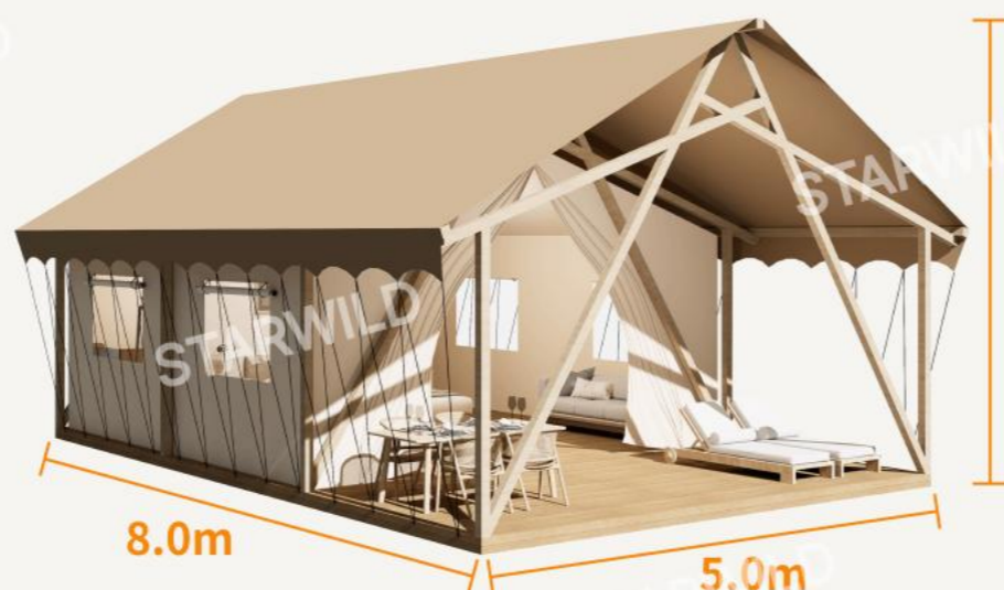
(3D Render-Assembly View)