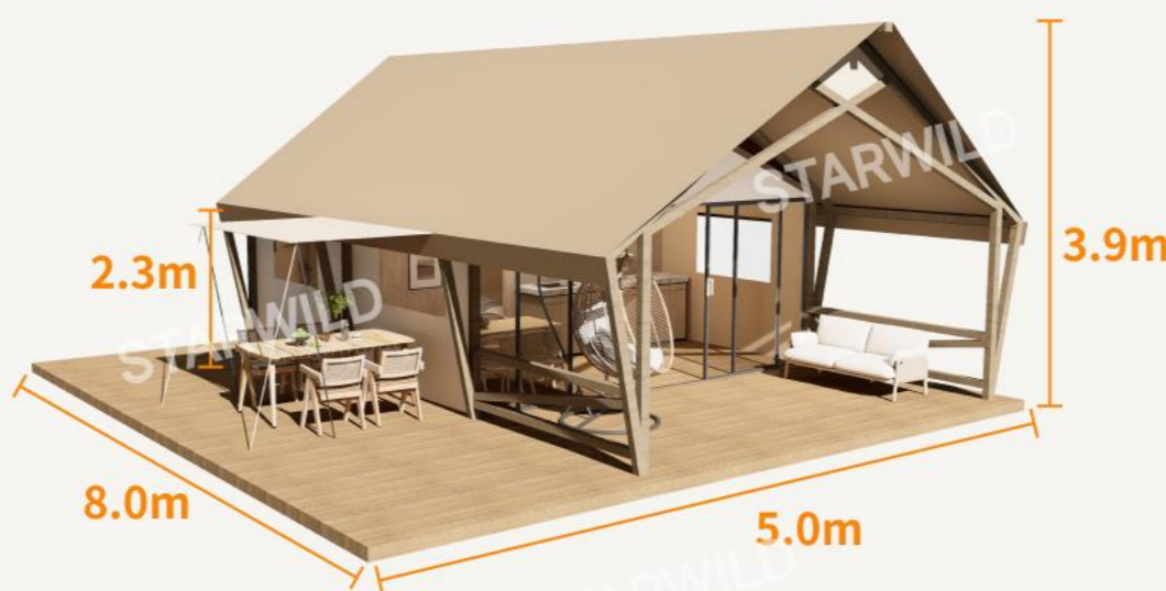
(3D Render-Assembly View)