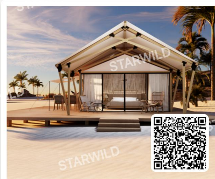
Starwild Glamping Mercury