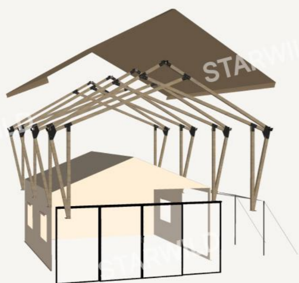
(3D Render-Exploded View)

Main Pipe: 80*80mm Galvanized Steel Pipe,2.0mm Thickness Argon Arc Welded, Hot-Dip Galvanized Corrosion-Resistant Galvanized Steel Plate Outdoor-Specific Baking Paint Treatment (Resistant To Sunlight And Rain)