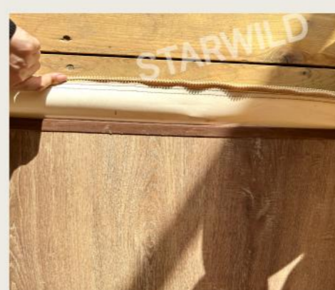
Moisture-Proof Ground Cloth