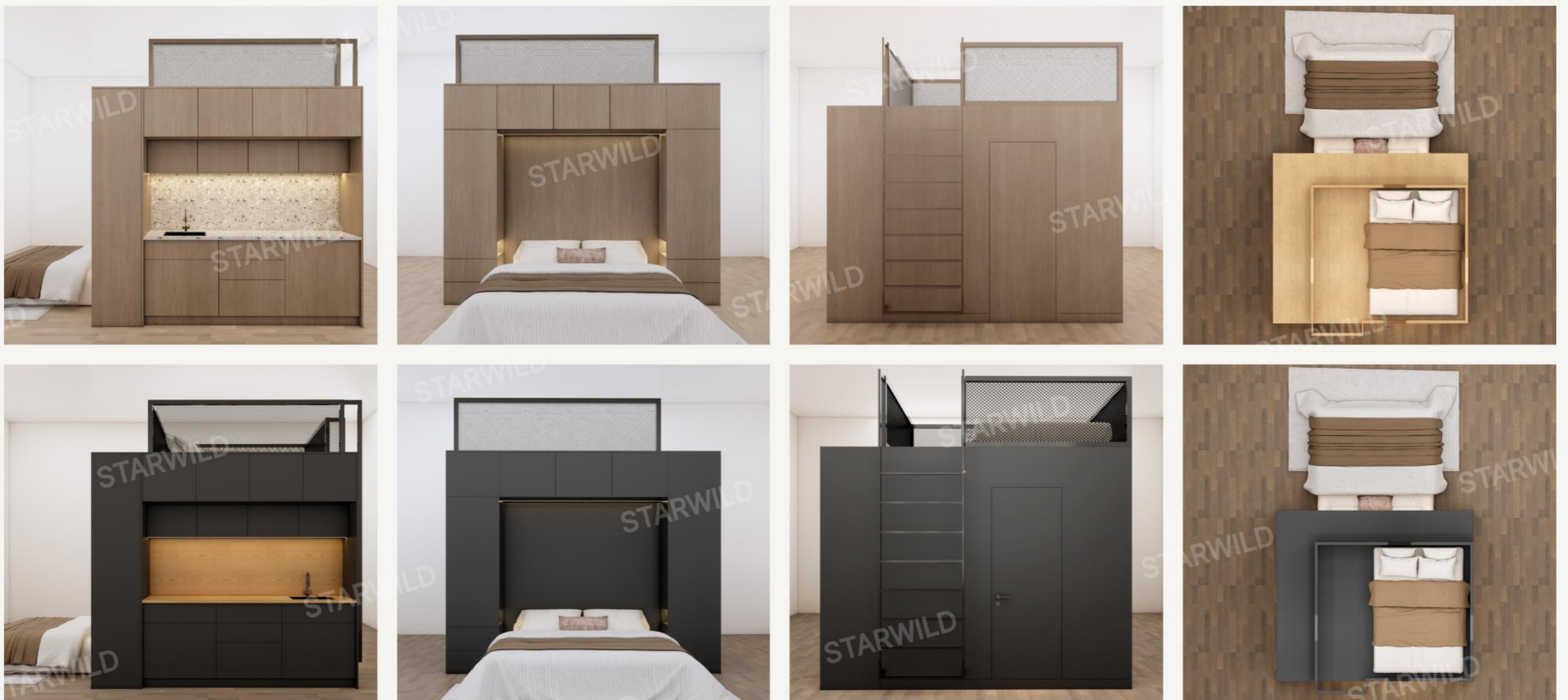
Overall Voxel Modular Support System Dimensions: 3140 × 4250 × 3170 mm