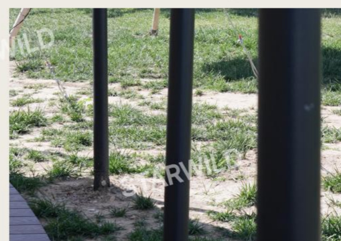
Corner Ground Fixing